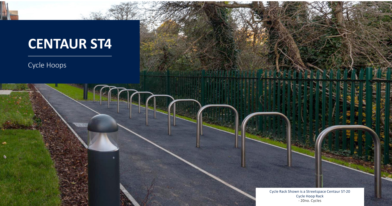
Cycle Rack Shown is a Streetspace Centaur ST-20 Cycle Hoop Rack - 20no. Cycles

CENTAUR ST cycle stands follow the design pattern of the ubiquitous Sheffield hoop and are the most cost-effective cycle storage product for storing small to medium numbers of bikes in public spaces and enclosed stores where available footprint is not restricted.