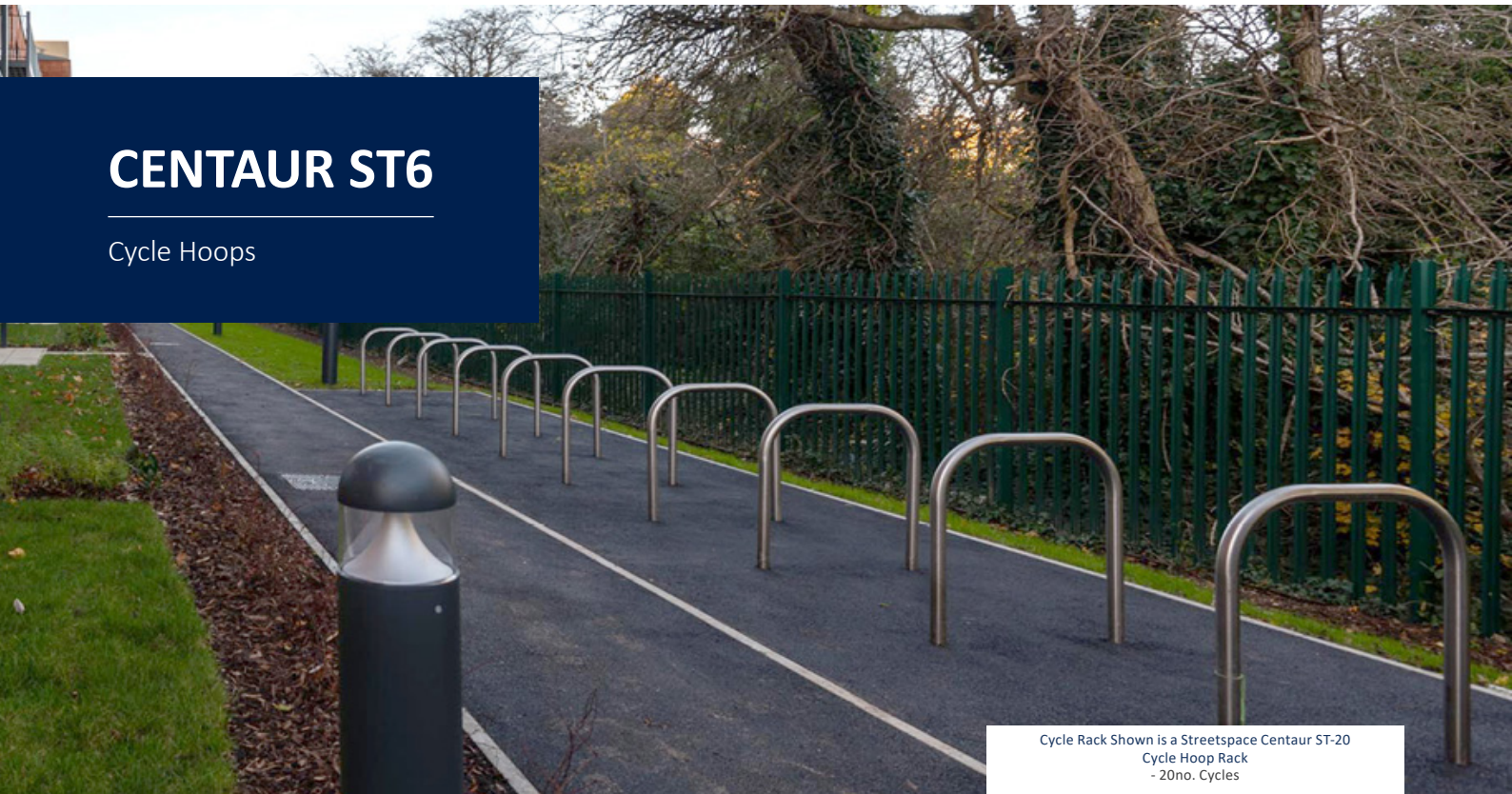
Cycle Rack Shown is a Streetspace Centaur ST-20 Cycle Hoop Rack - 20no. Cycles

CENTAUR ST cycle stands follow the design pattern of the ubiquitous Sheffield hoop and are the most cost-effective cycle storage product for storing small to medium numbers of bikes in public spaces and enclosed stores where available footprint is not restricted.