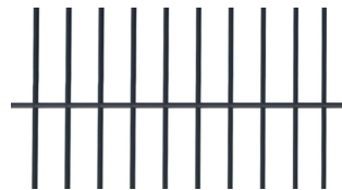
Zed Pannel V-Mesh Black