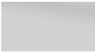
Hot Dip Galvanised