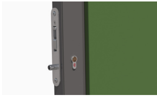
Eurocylinder Lock (Sliding Doors Only)

Integral locking system is located within the sliding door frame with a key operated deadlock. Handles are integral to the sliding door frame.