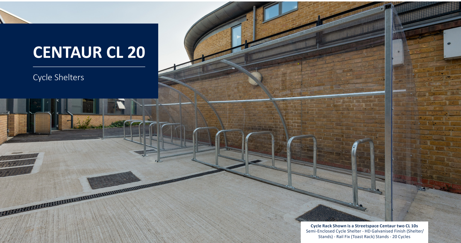
Cycle Rack Shown is a Streetspace Centaur two CL 10s Semi-Enclosed Cycle Shelter - HD Galvanised Finish (Shelter/ Stands) - Rail Fix (Toast Rack) Stands - 20 Cycles

CENTAUR CL can be specified as a secure cycle shelter compound with the addition of sliding steel mesh gate panels to the front elevation. ZedPanel colour coated steel mesh cladding panels, durable steel and nylon roller tracks and a choice of access control systems.