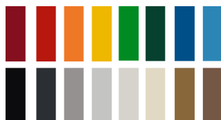
Colour Polyester Powdercoat