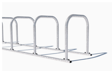
Rail Fix (Toast Rack)

Stands are surface mounted to ground fix steel rails.